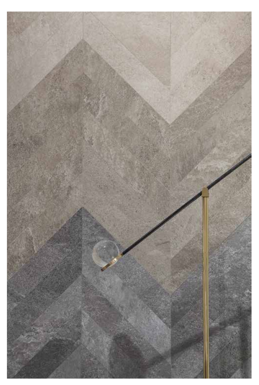
LIGHT (Off White) Taupe Dark (Anthracite)