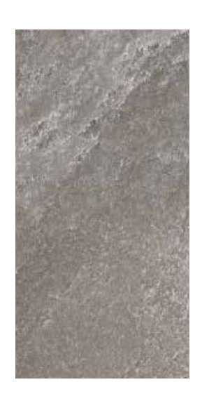
30 x 60 cm (12 x 24) SO.ST.GRY.1224.MT