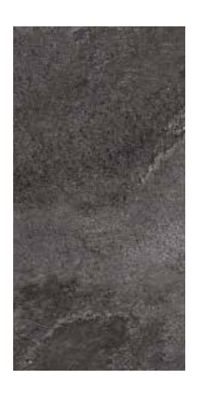
30 x 60 cm (12 x 24) SO.ST.DRK.1224.MT

All items shown in this document are part of Olympia's stocking program. For special orders, please contact your Olympia Tile Sales Representative.