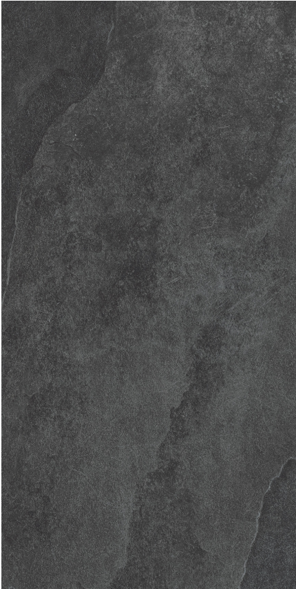
30 x 60 cm (11.82 x 23.63) EX.LP.ANT.1224.MT

All items shown in this document are part of Olympia's stocking program. For special orders, please contact your Olympia Tile Sales Representative.