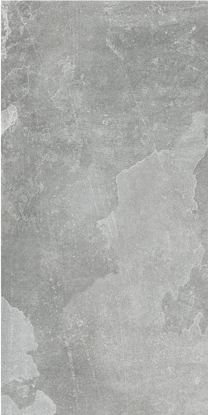
30 x 60 cm (11.82 x 23.63) EX.LP.GRY.1224.MT