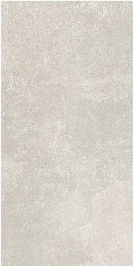
30 x 60 cm (11.82 x 23.63) EX.LP.BGE.1224.MT

All items shown in this document are part of Olympia's stocking program. For special orders, please contact your Olympia Tile Sales Representative.