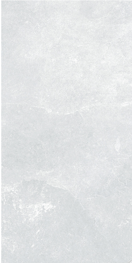
30 x 60 cm (11.82 x 23.63) EX.LP.WHT.1224.MT