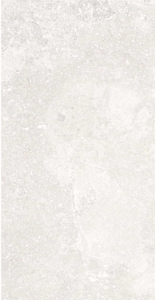
WHITE Matte Finish

30 x 60 cm (12" x 24") Thickness: 8.5 mm AV.BS.WHT.1224.MT