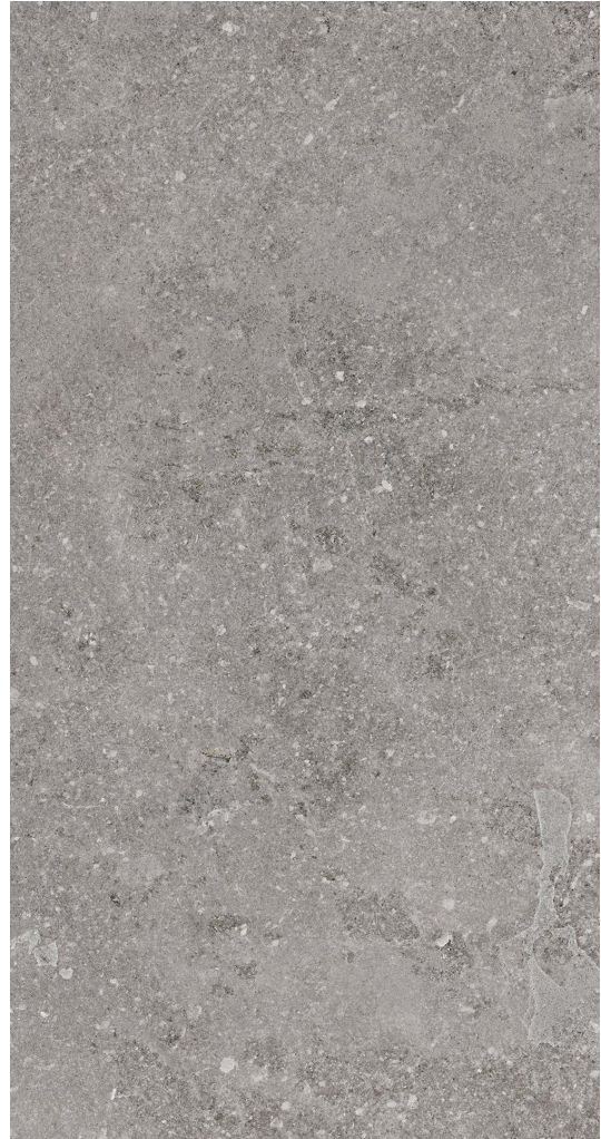
NATURE Matte Finish

60 x 120 cm (24" x 48") Thickness: 9 mm AV.BS.WHT.2448.MT